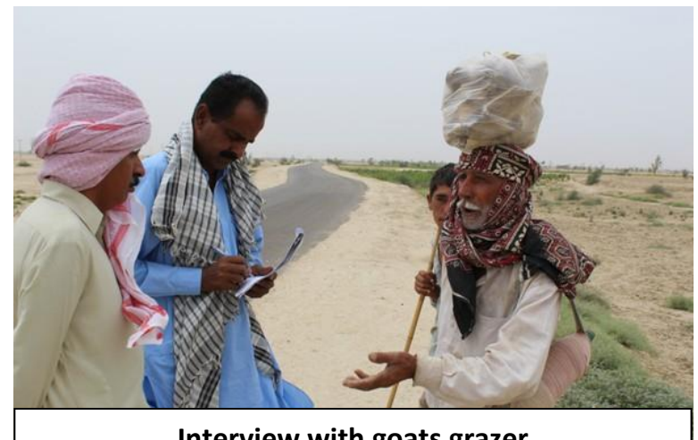
Interview with goats grazer

to draw drinking water, women with bundles of cloths on their