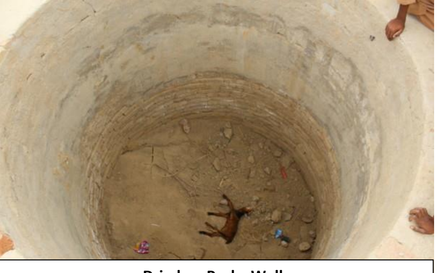
Dried up Packa Wells

villagers at different points erect huge barriers or Bands to check high flow of water from rapidly flowing. The purpose is to keep the water stopped for some time that the soil can absorb enough water that can help in germination, growing and ripping of the crop because there is no arrangement for arranging water for second and third time for the crop. Previously when agricultural machinery like tractors were not available the farmers pooled their resources like oxen, ploughs and men to erect the Ghandhas but now the huge soil erection is done thorough tractors. Numerous ghandhas are erected on different points. These vary in length, width and height. Some are as long as one or two KMs long. And others are 100 or 200 meters long. The erection cost also varies with the lengths, width and size.