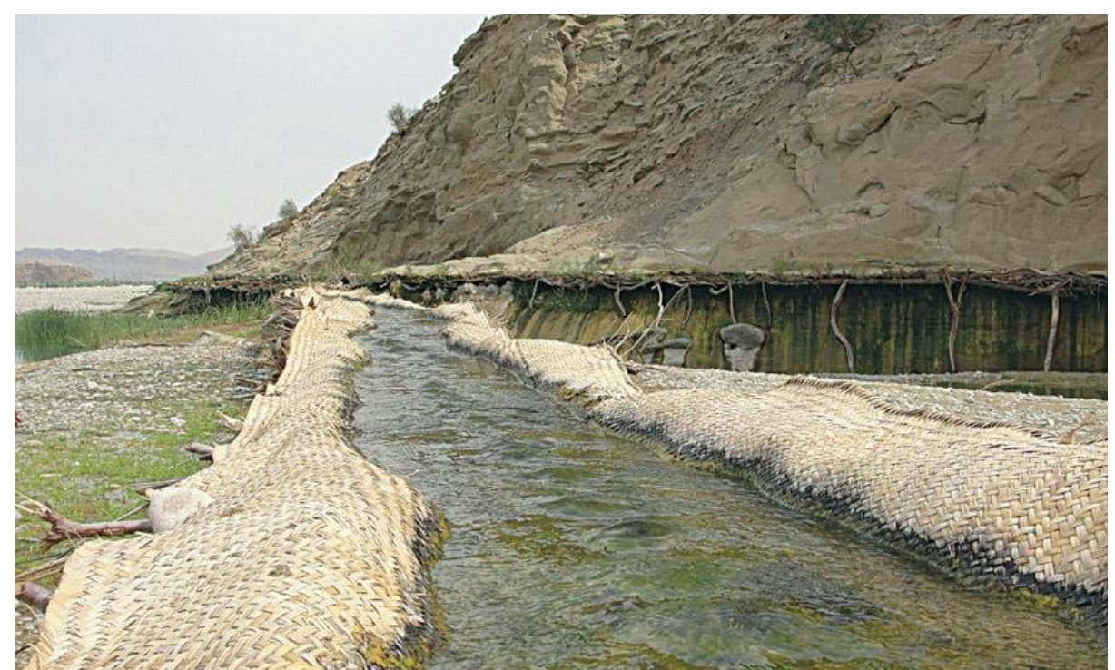
spread and bended. Nai water pressure is used to push water climb on this manual made water course and this water through mad irrigation is used to irrigate the lands at upper places.